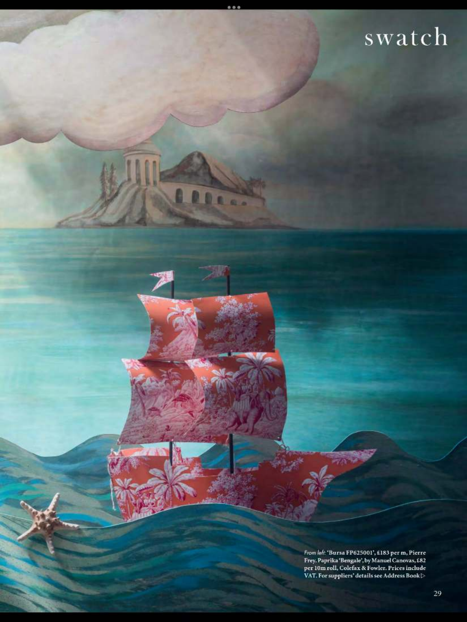
From left: 'Bursa FP625001', £183 per m, Pierre Frey. Paprika 'Bengale', by Manuel Canovas, £82 per 10m roll, Colefax & Fowler. Prices include VAT. For suppliers' details see Address Book >