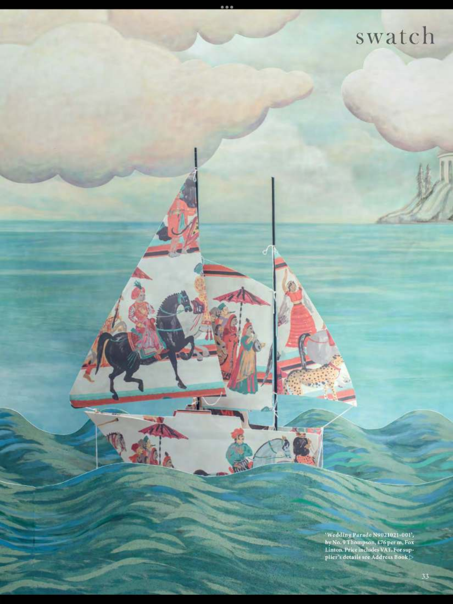
'Wedding Parade N9021021-001', by No. 9 Thompson, £76 per m, Fox Linton. Price includes VAT. For sup- plier's details see Address Book >