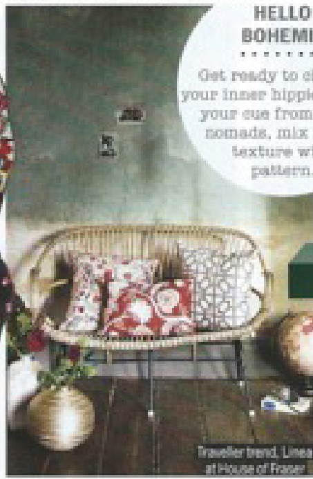
Traveller trend, Lines at House of Fraser