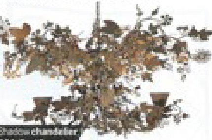
Ivy Shadow chandelier, £7,824, Todd Boonle at Porta Romana

Get ready to channel your inner hippie. Taking your cue from global nomads, mix rough texture with pattern.