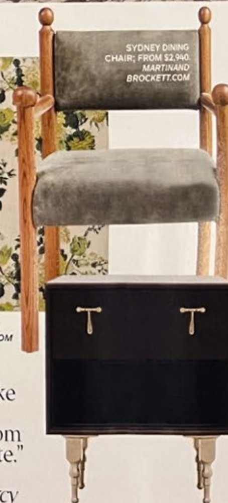
SYDNEY DINING CHAIR; FROM $2,940. MARTINAND BROCKETT.COM