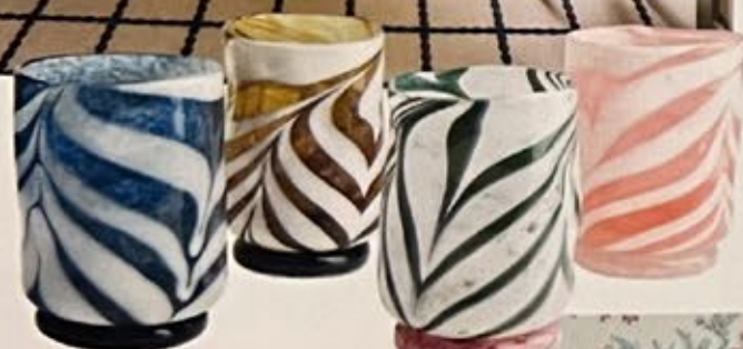
SWIRL MID-BALL GLASS TUMBLERS; $168 EACH. HENRYHOLLANDSTUDIO.COM