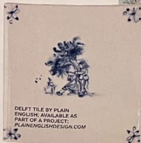
DELFT TILE BY PLAIN ENGLISH; AVAILABLE AS PART OF A PROJECT. PLAINENGLISHDESIGN.COM