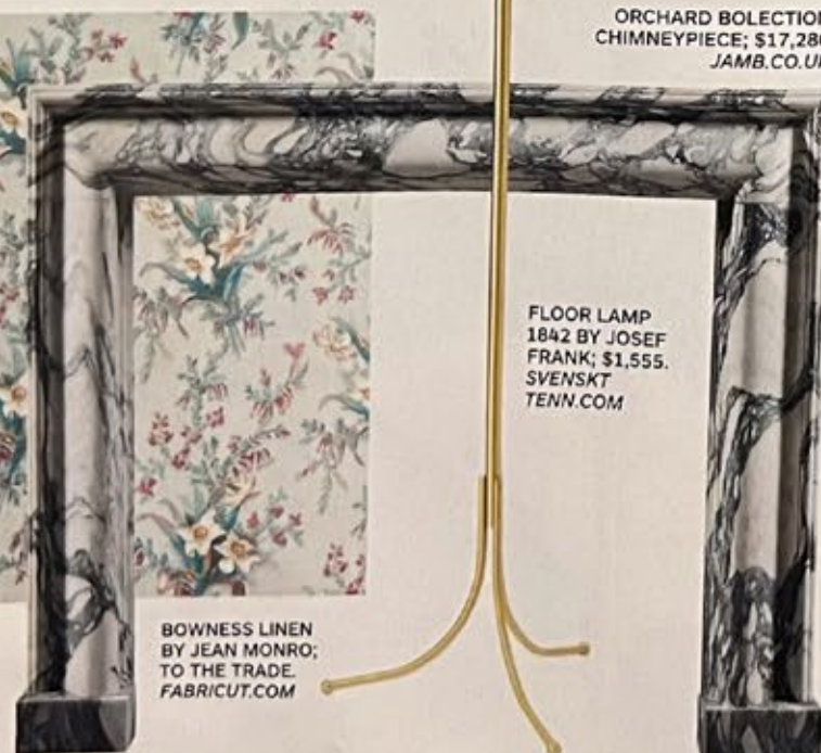
ORCHARD BOLECTION CHIMNEYPIECE; $17,280. JAMB.CO.UK

FLOOR LAMP 1842 BY JOSEF FRANK; $1,555. SVENSKT TENN.COM