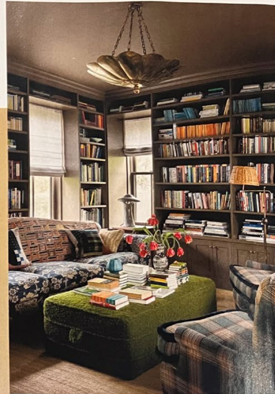
RIGHT IN THE STUDY, A JAMB SOFA IN A BDDW FLORAL FACES A PAIR OF JAMB CLUB CHAIRS IN A CLARENCE HOUSE PLAID WITH SAMUEL & SONS TRIM. THE NICKEY KEHOE OTTOMAN IS COVERED IN A PIERRE FREY BOUCLÉ. SOANE BRITAIN PENDANT LIGHT. BELOW CUSTOM TILES BY REGTS LINE A NICHE IN THE GUEST BATH. THE TUB IS BY THE WATER MONOPOLY WITH A WATERWORKS FILLER.