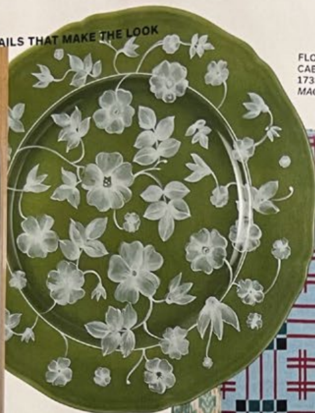
CERULEAN SKY BLANKET; $450. GREGORYPARKINSON.COM

A CUSTOM VANITY TOPPED WITH BARDIGLIO BLUE MARBLE, CUSTOM FLOOR TILES BY ZIA TILE, AND BEADBOARD WALLS CREATE AN INVITING GUEST BATH.