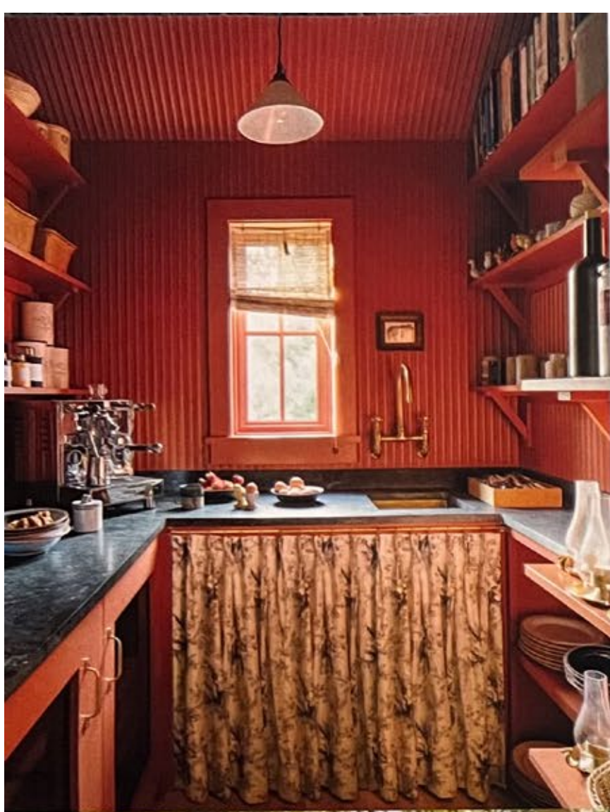
LEFT FARROW & BALL'S BAMBOOZLE COLORS THE PANTRY; SINK SKIRT FABRIC BY JEAN MUNRO; DEVOL PENDANT; BARBER WILSONS & CO. SINK FITTINGS. BOTTOM LEFT CABANA X BONACINA CHAIRS SURROUND AN RH TABLE ON A TERRACE.