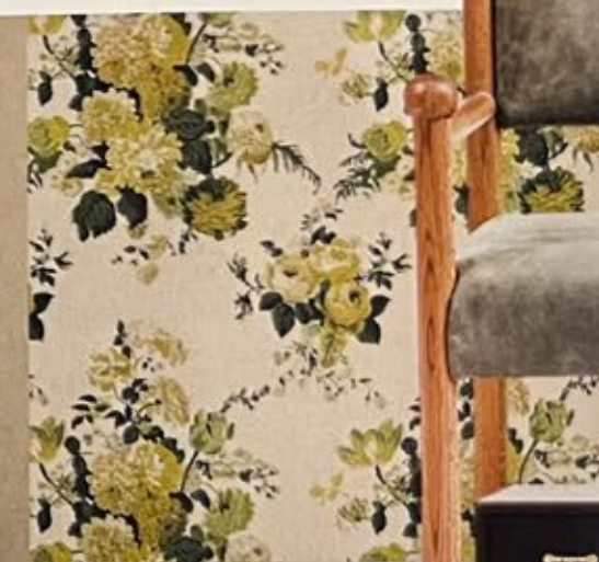
DAHLIA HAND-BLOCK LINEN; TO THE TRADE. CLARENCEHOUSE.COM